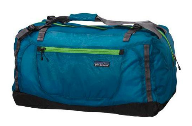
\underline{\text{This Photo}} by Unknown author is licensed under \underline{\text{CC}} \underline{\text{BY-SA}}.