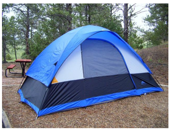
\frac{\text{This Photo}}{\text{BY}} \text{ by Unknown author is licensed under } \underline{\text{CC}}