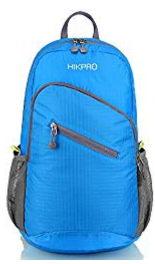
This Photo by Unknown author is licensed under <u>CC BY-NC-ND</u>.