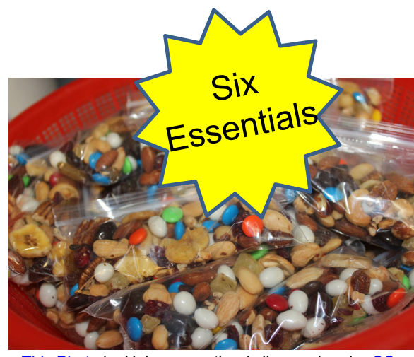
This Photo by Unknown author is licensed under <u>CC BY-NC-ND</u>.