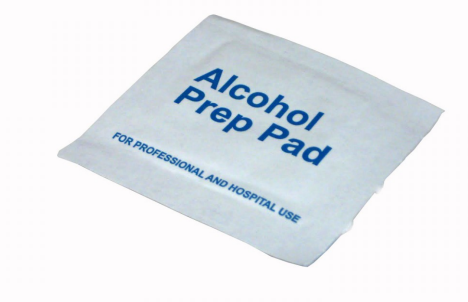
This Photo by Unknown author is licensed under CC

This Photo by Unknown author is licensed under CC BY-SA