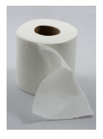
And whatever else you need