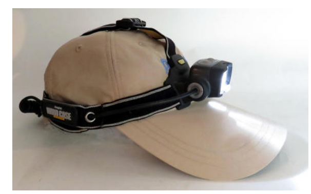
\label{eq:constraint} \frac{\text{This Photo}}{\text{BY-NC-ND}} \text{ by Unknown author is licensed under } \frac{\text{CC}}{\text{BY-NC-ND}}.

If a headlamp is used, having one with a "red light" mode is preferred, as it helps reduce the annoyance of having a light shined at you in camp. Red cellophane tape can be put over a headlamp lens to convert it to a red light.